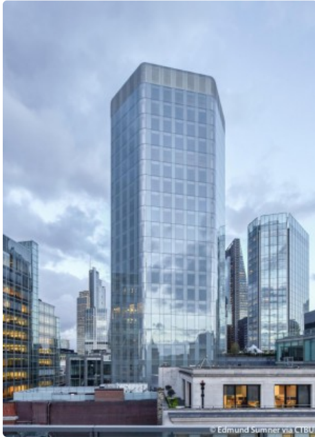
Click an image to view larger version.

This project is a renovation and replaced Angel Court Tower