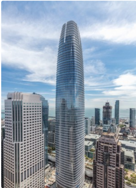
Click an image to view larger version.